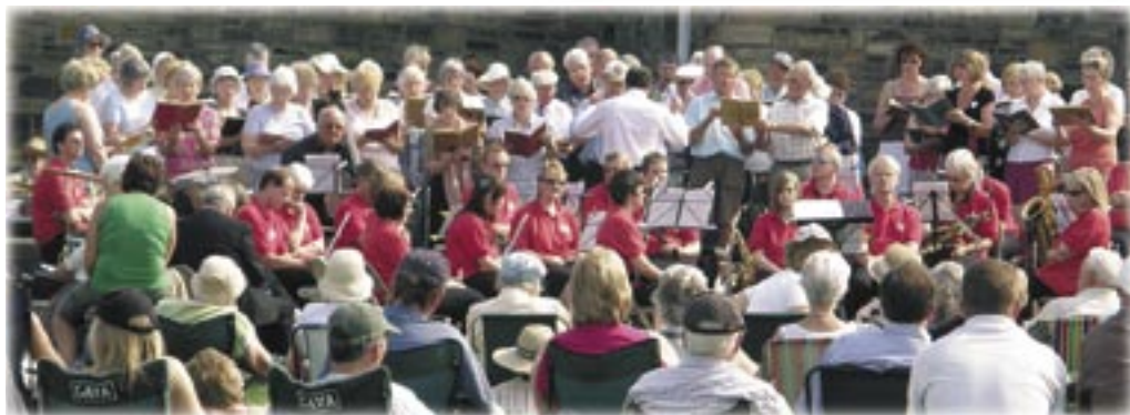
Golcar Sing 2008.