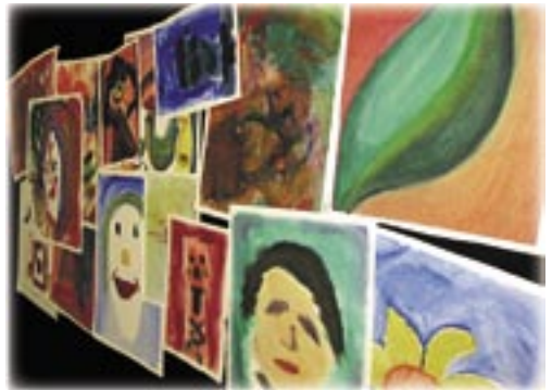
Some of the work produced by participants in the art workshops at last year's Lily Day

You can see the society's annual exhibition at the Colne Valley Museum from Saturday 24 April to Sunday 6 June. It's a great opportunity to see work from talented local artists. Most items are for sale; plus there's the usual bargain corner that's full of items (maximum price £15) to buy and take home immediately.